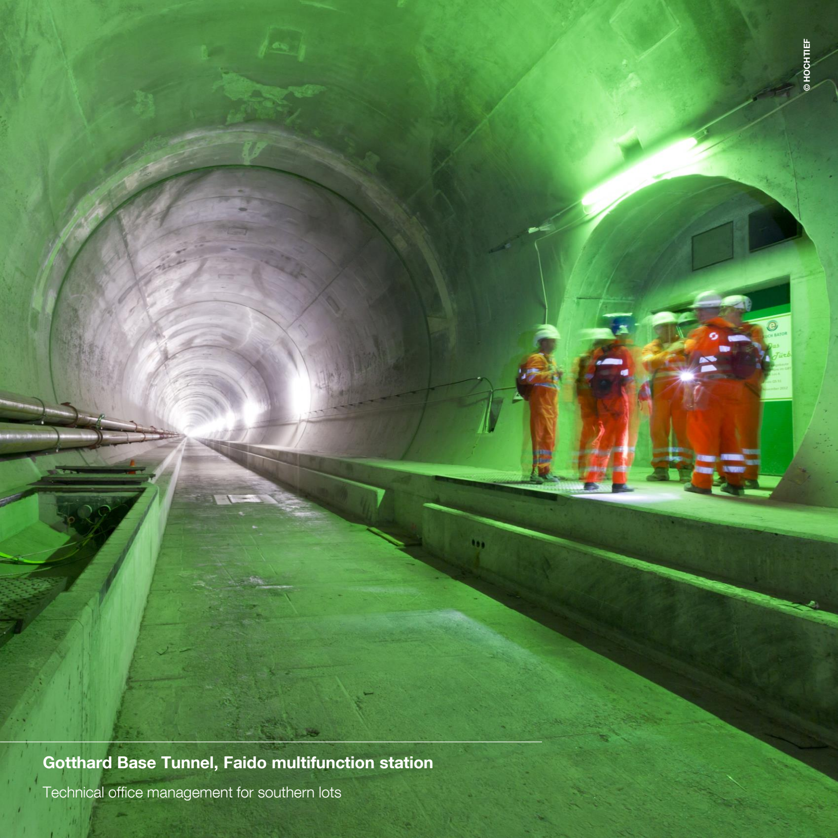
Gotthard Base Tunnel, Faido multifunction station

As part of the HOCHTIEF Group, we also have the global insurance cover of a comprehensive policy as well as extraordinary capitalisation and security.